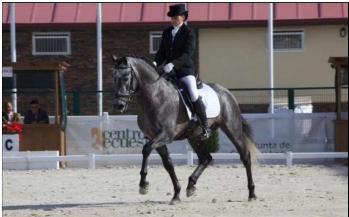
Compiting with Young Horse in a CDN***