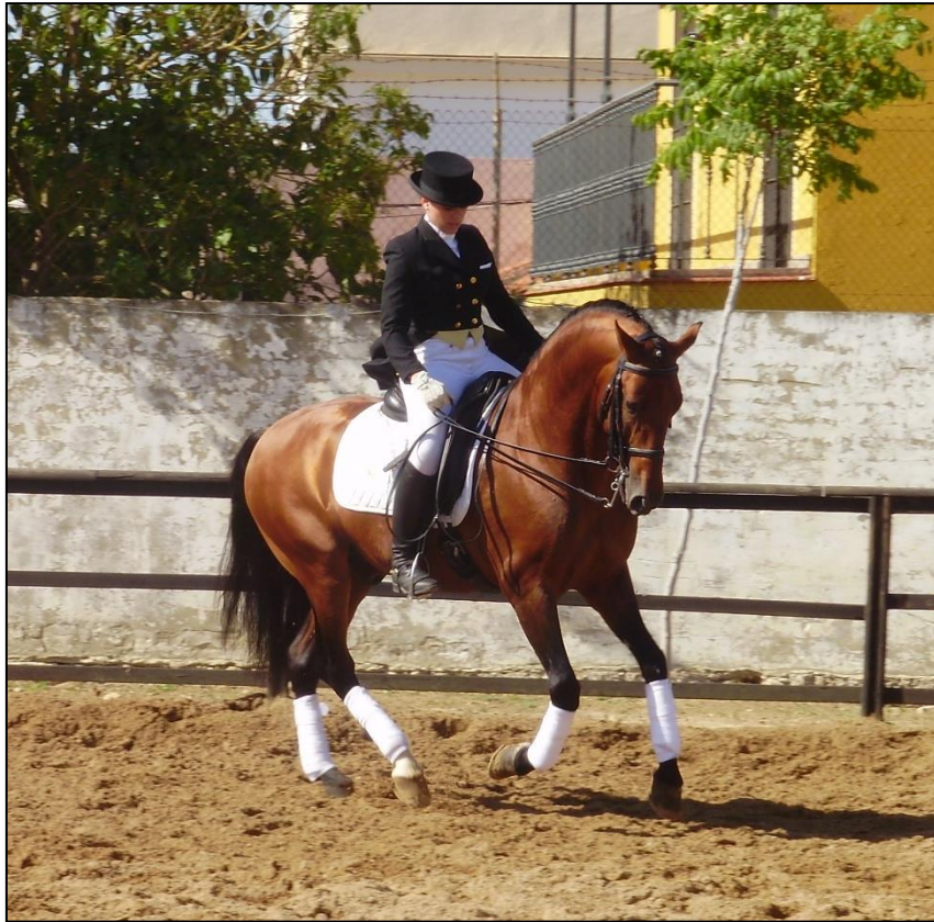
PSG Competition (Nazaret Club)