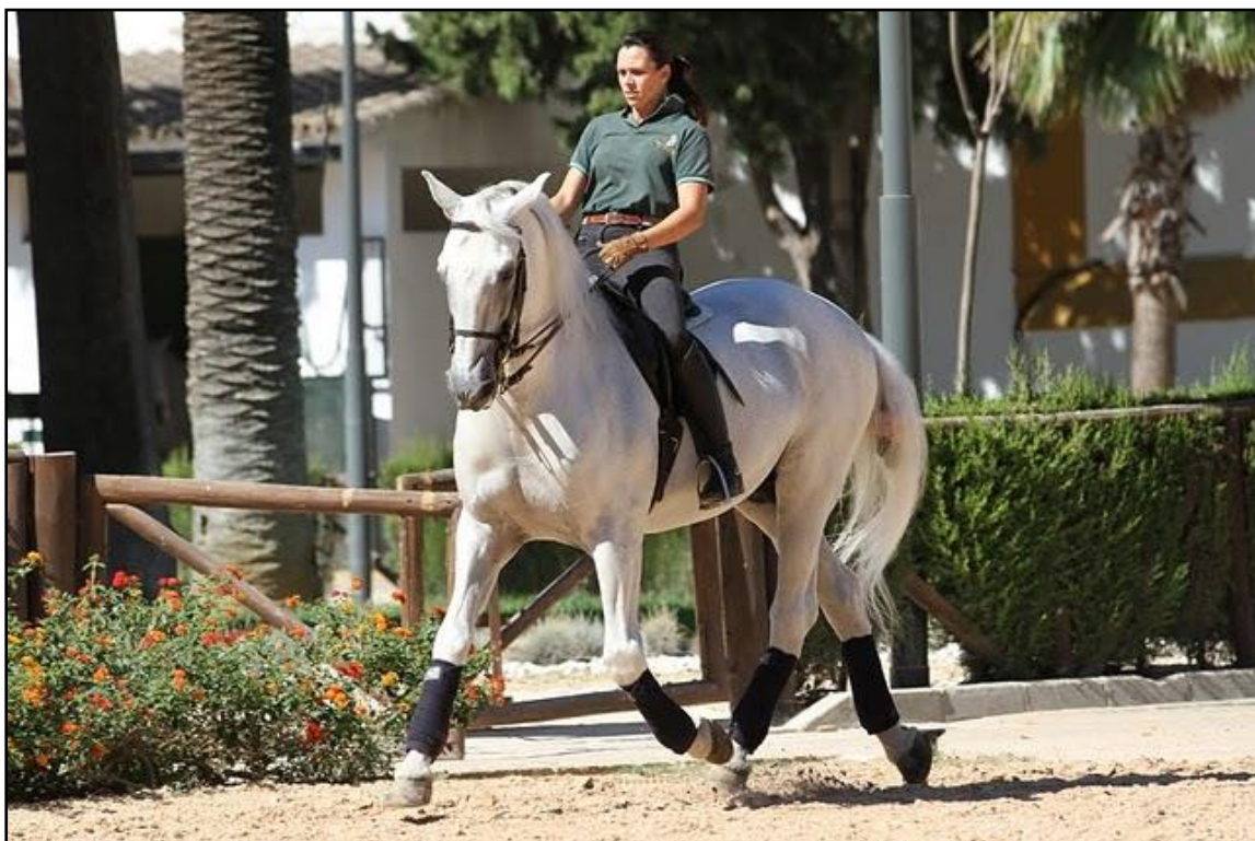
Shoulder in with Invasor (Royal Andalusian School of Equestrian Art)