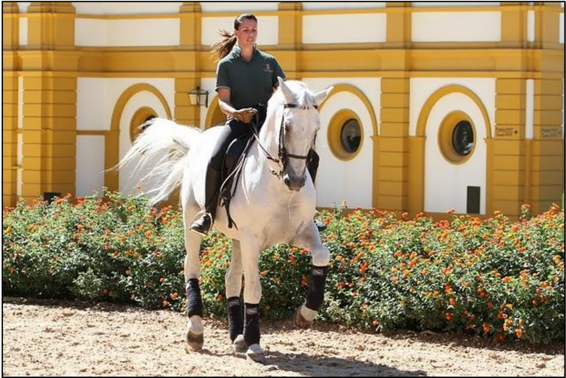
Piaffé with Invasor (Royal Andalusian School of Equestrian Art)