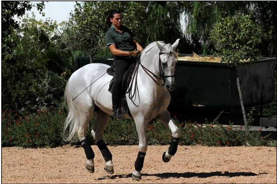
Pirue with Invasor (Royal Andalusian School of Equestrian Art)