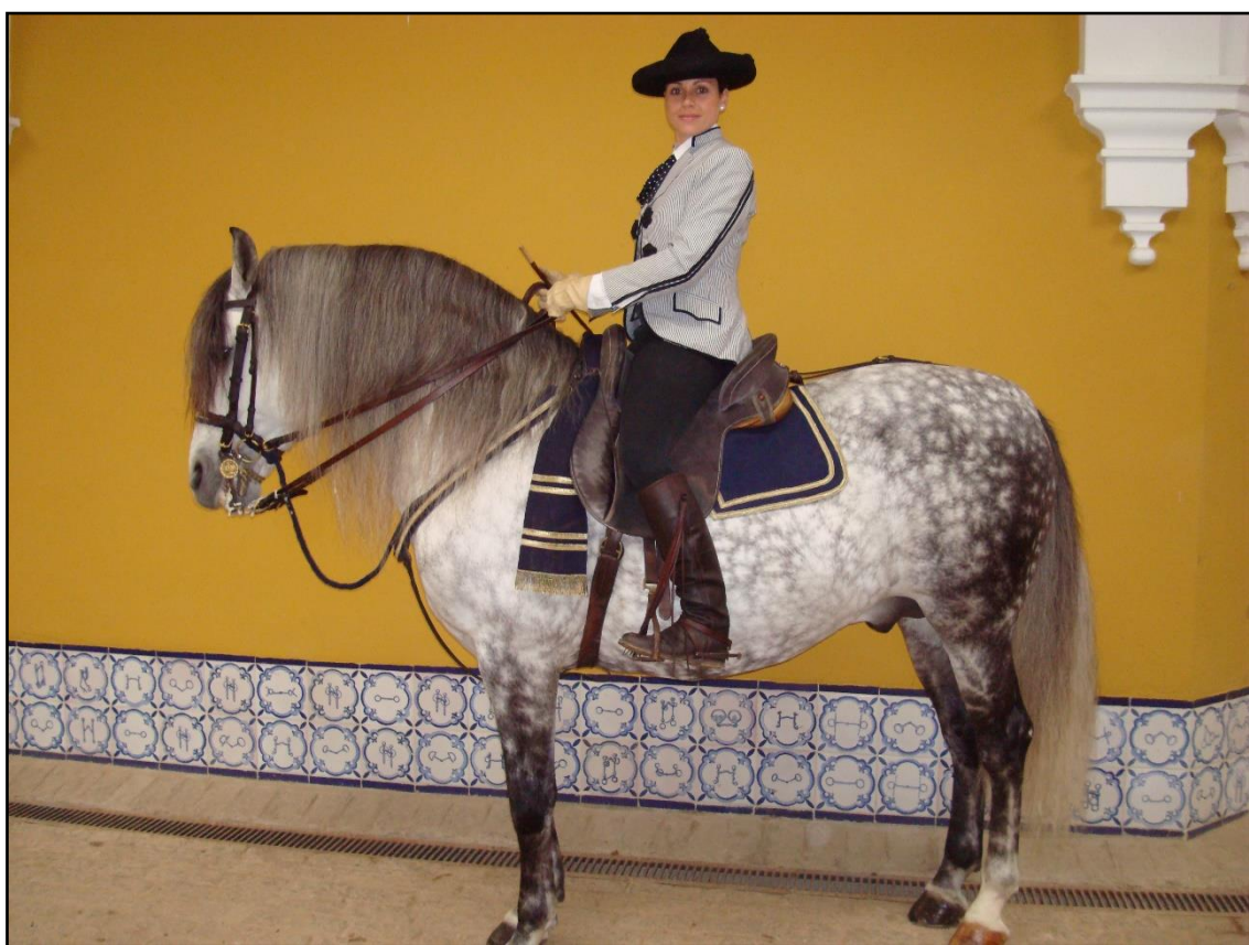
Previous moments at the Royal School Show, Amapolo