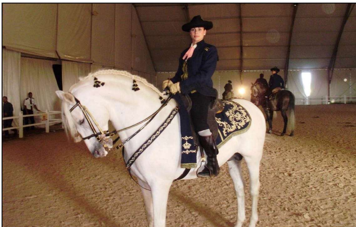
Previous moments at the Morocco Royal School Show, Bolero.